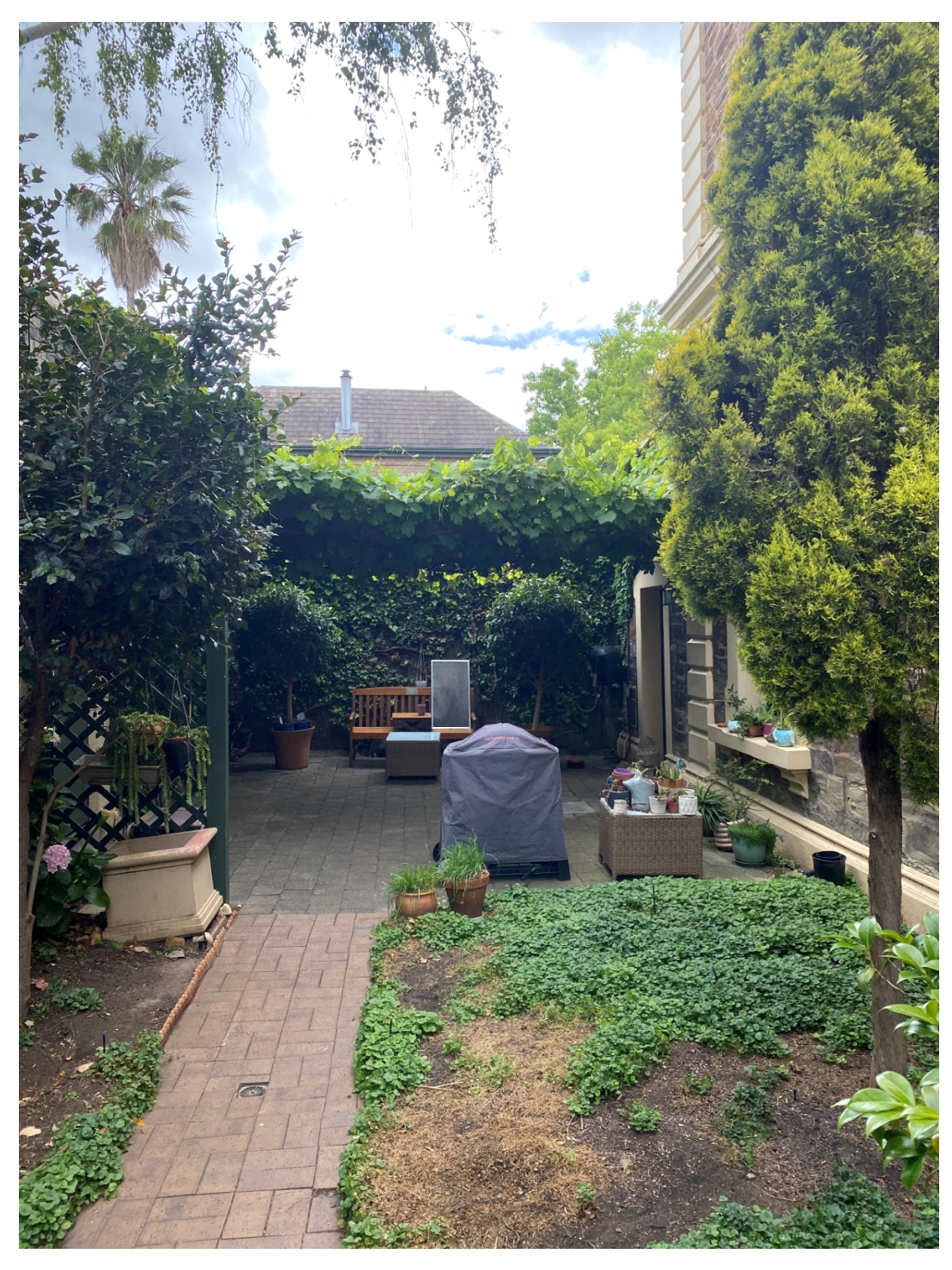
Figure 3.7 - private open space at18 Dimora Court looking west