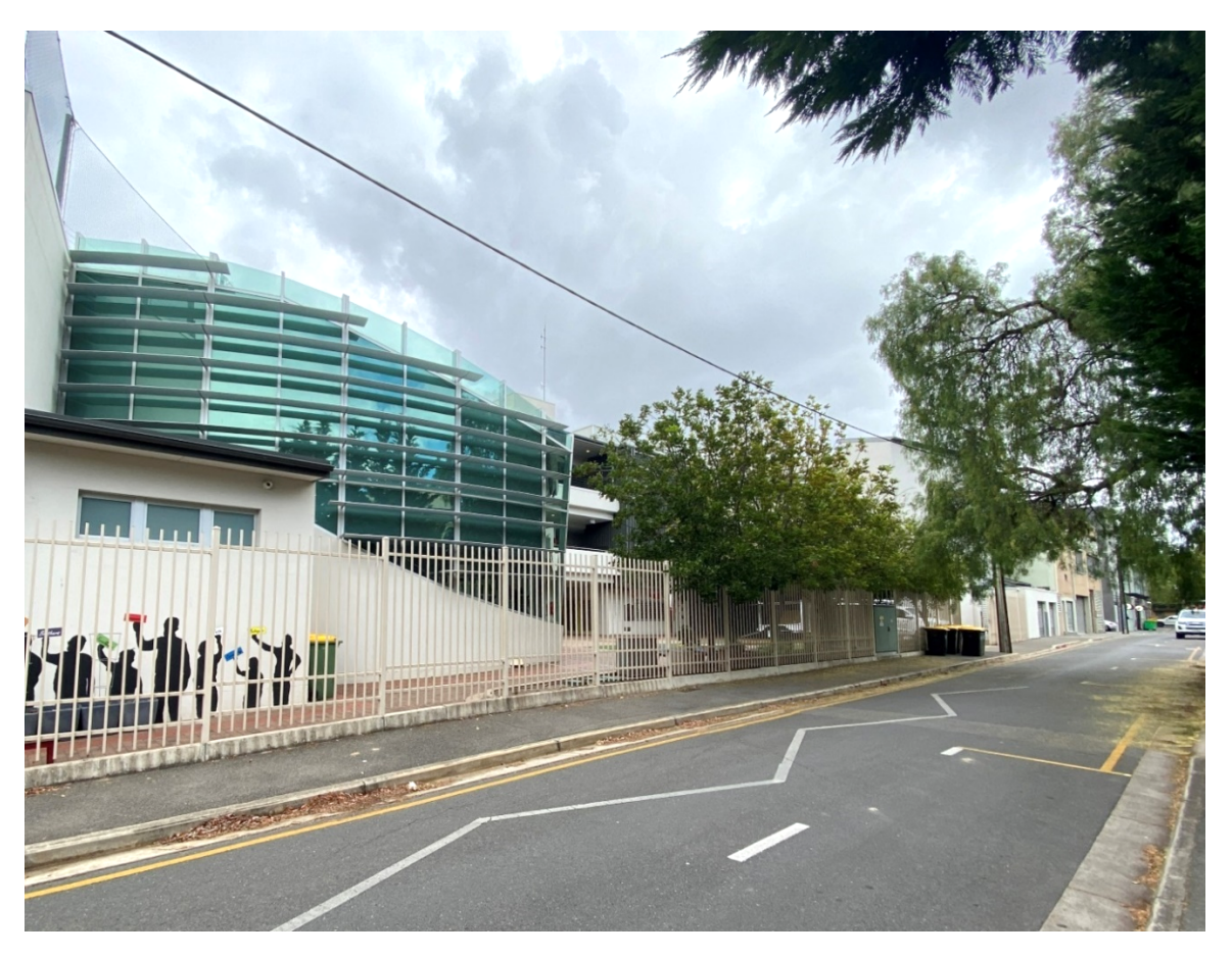
Figure 3.3 - rear of Christian Brothers School, located opposite subject site