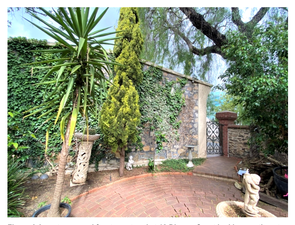
Figure 3.6 - entrance and front courtyard at 18 Dimora Court looking southeast