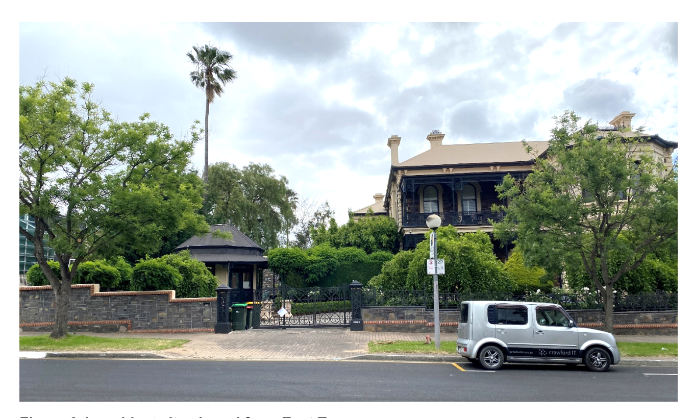
Figure 3.1 - subject site viewed from East Terrace