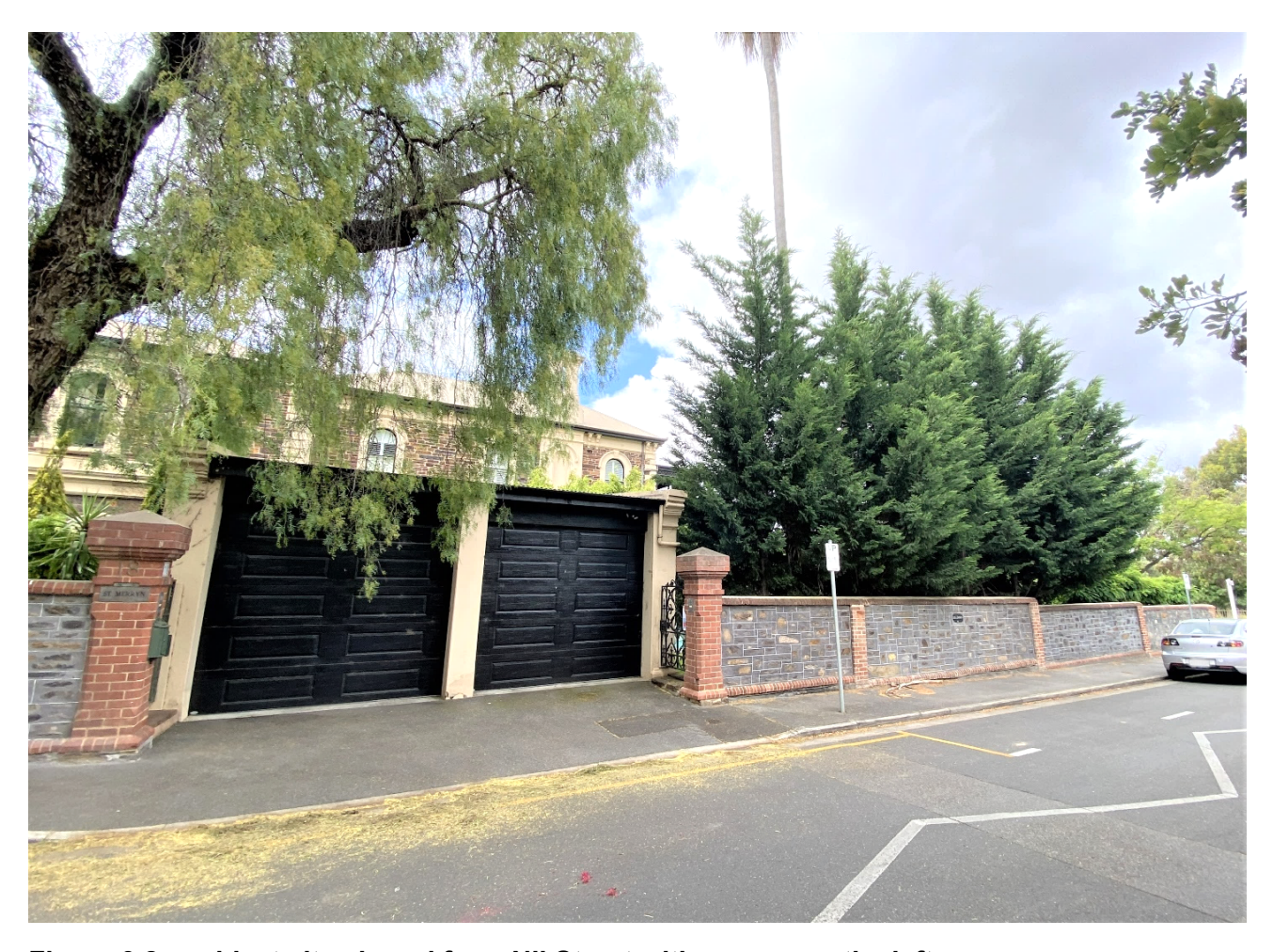
Figure 3.2 - subject site viewed from Nil Street with garage on the left