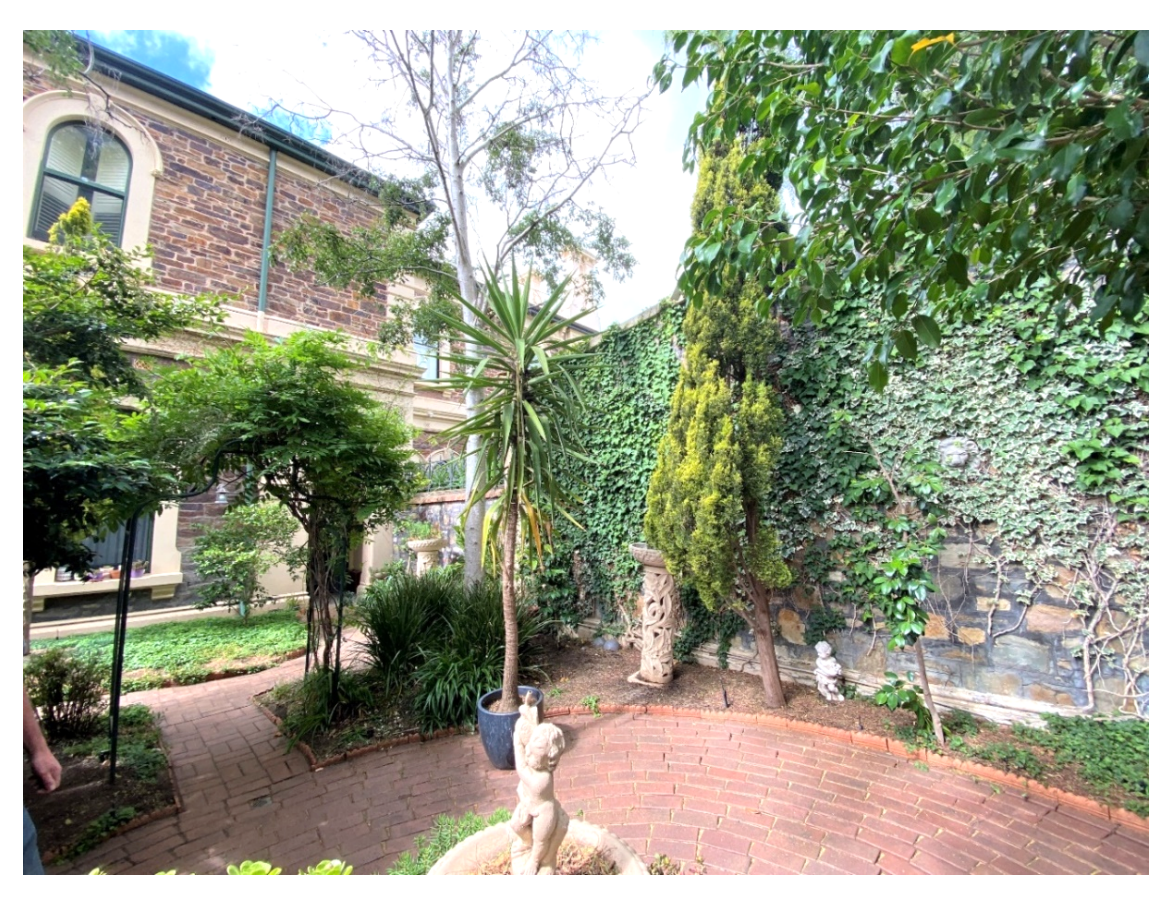
Figure 3.5 - view of courtyard at 18 Dimora Court with west wall of subject garage